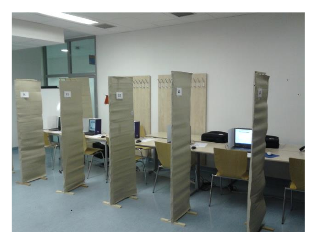
FIGURE B.II: TSST-G SETTING